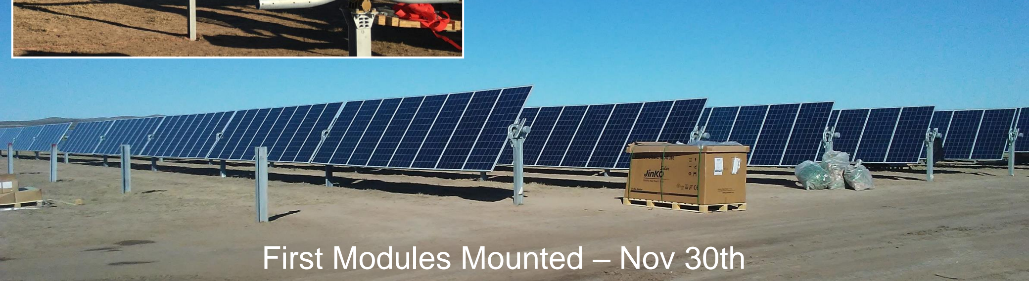
First Modules Mounted – Nov 30th